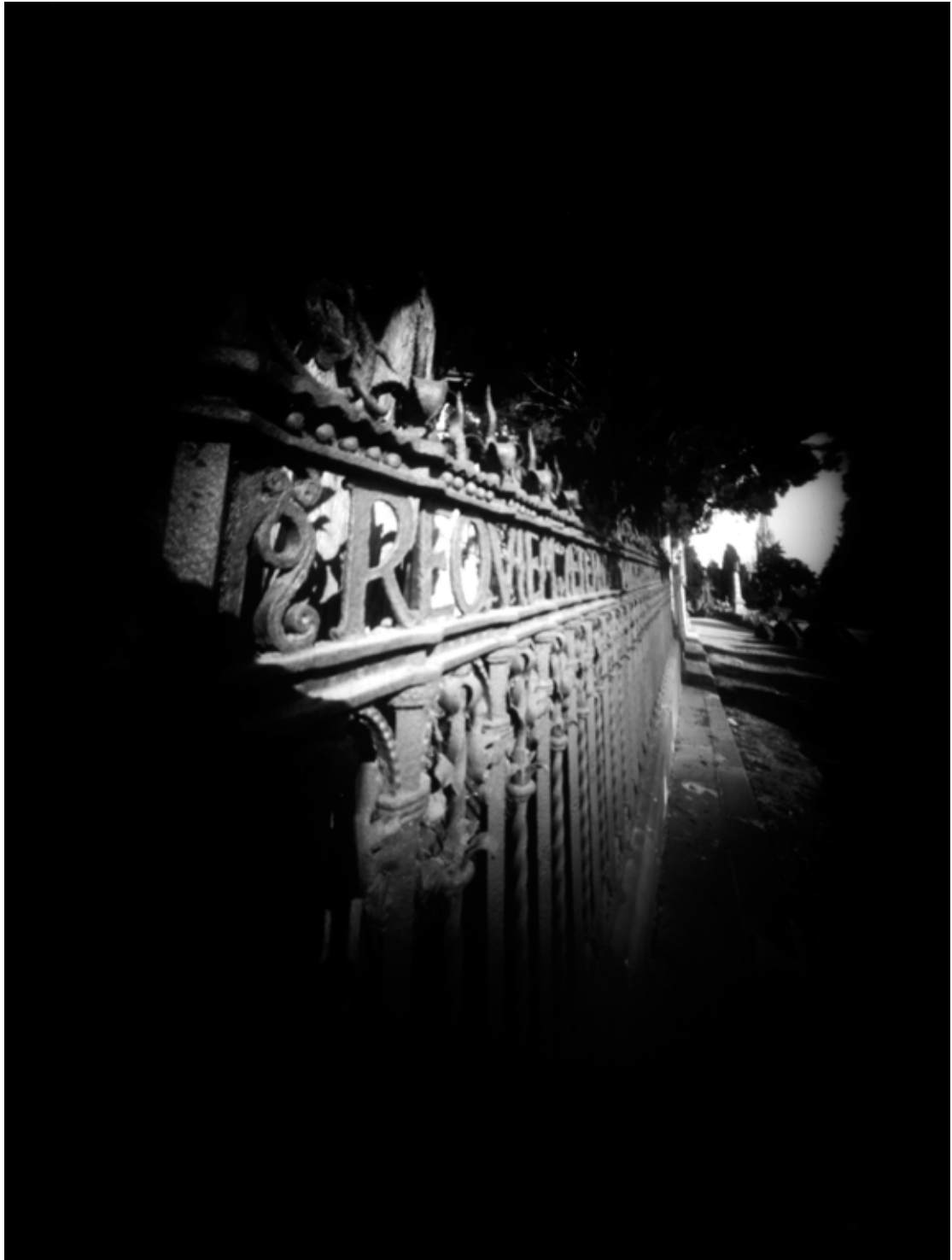
Requiem 0 (Fence) . Barcelona, 2007 Silver Gelantine Print 60x45 cm