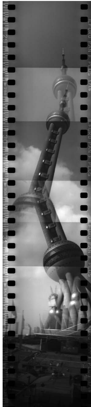
Dancing Giants – Oriental Pearl Tower. Shanghai. 2011 35x165 cm (ricepaper/silk scroll 220x50 cm)