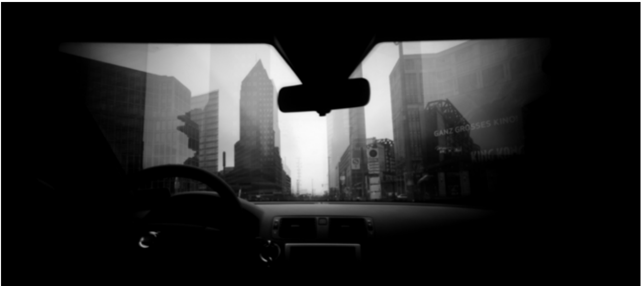
Grenzvernetzer – Potsdamer Platz. Berlin, 2008 C Print Diasec, 40x90 cm