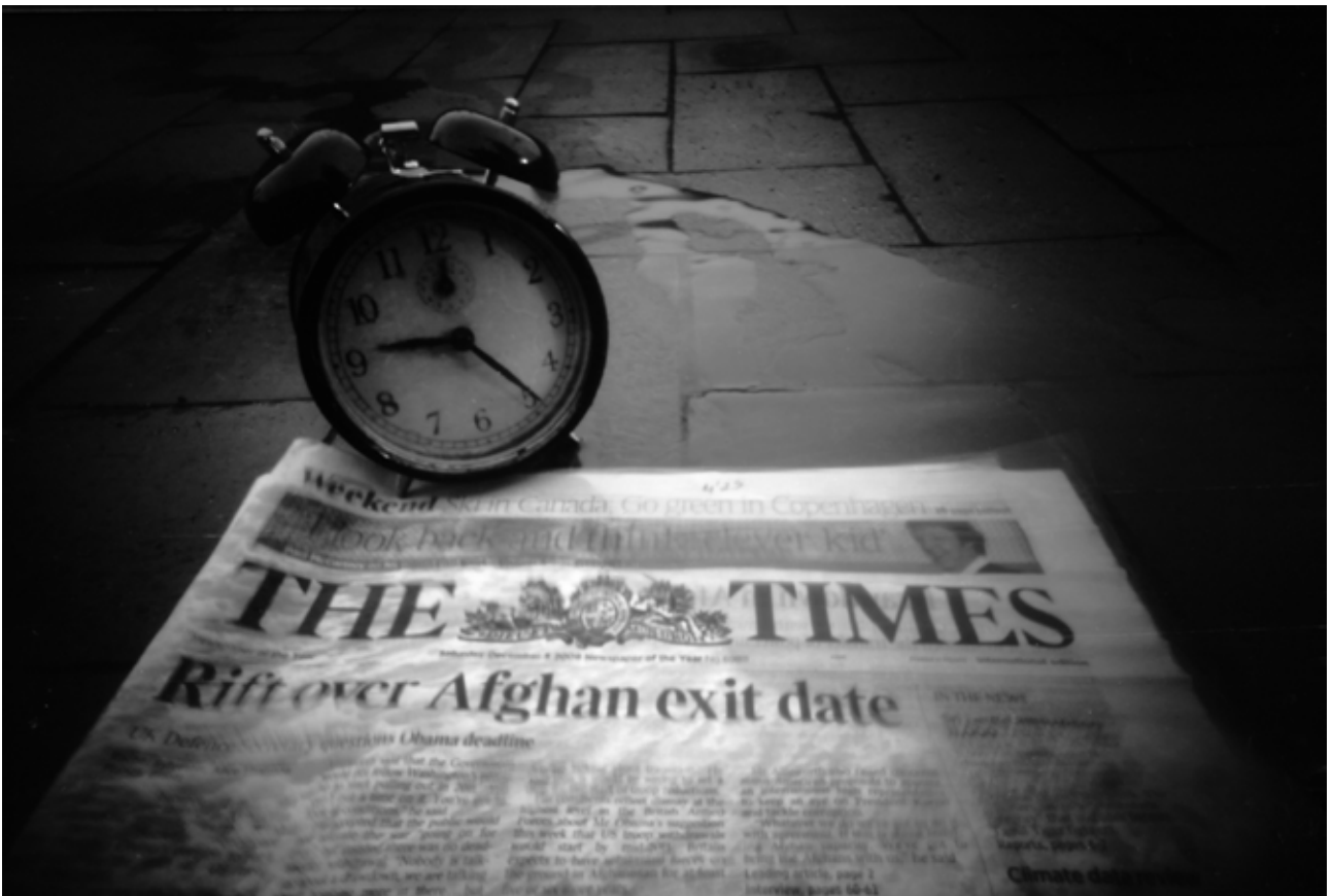
Time Elements. Barcelona, 2009 C Print Diasec,30x40 cm (4pcs)