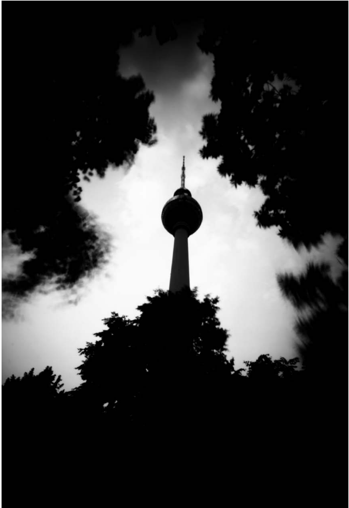
Fernsehturm – Boxocam. Berlin, 2007 Hahnemühle Fine Art Print, 60x40 cm