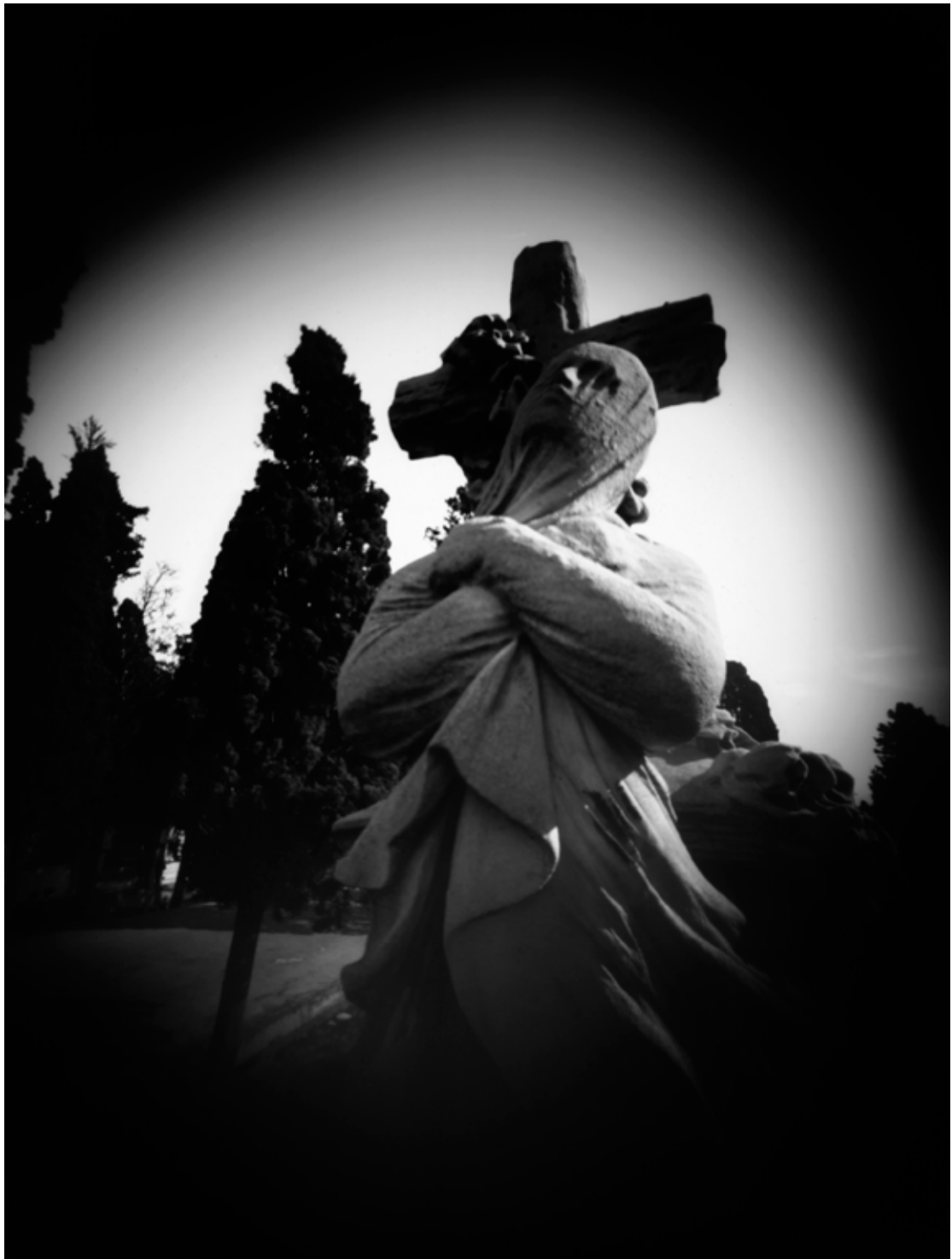
Requiem VI (Resurrection) . Barcelona, 2007 Silver Gelantine Print 60x45 cm