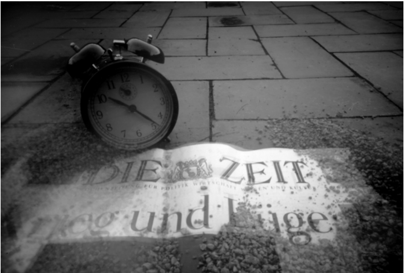
Time Elements. Barcelona, 2009 C Print Diasec,30x40 cm (4pcs)