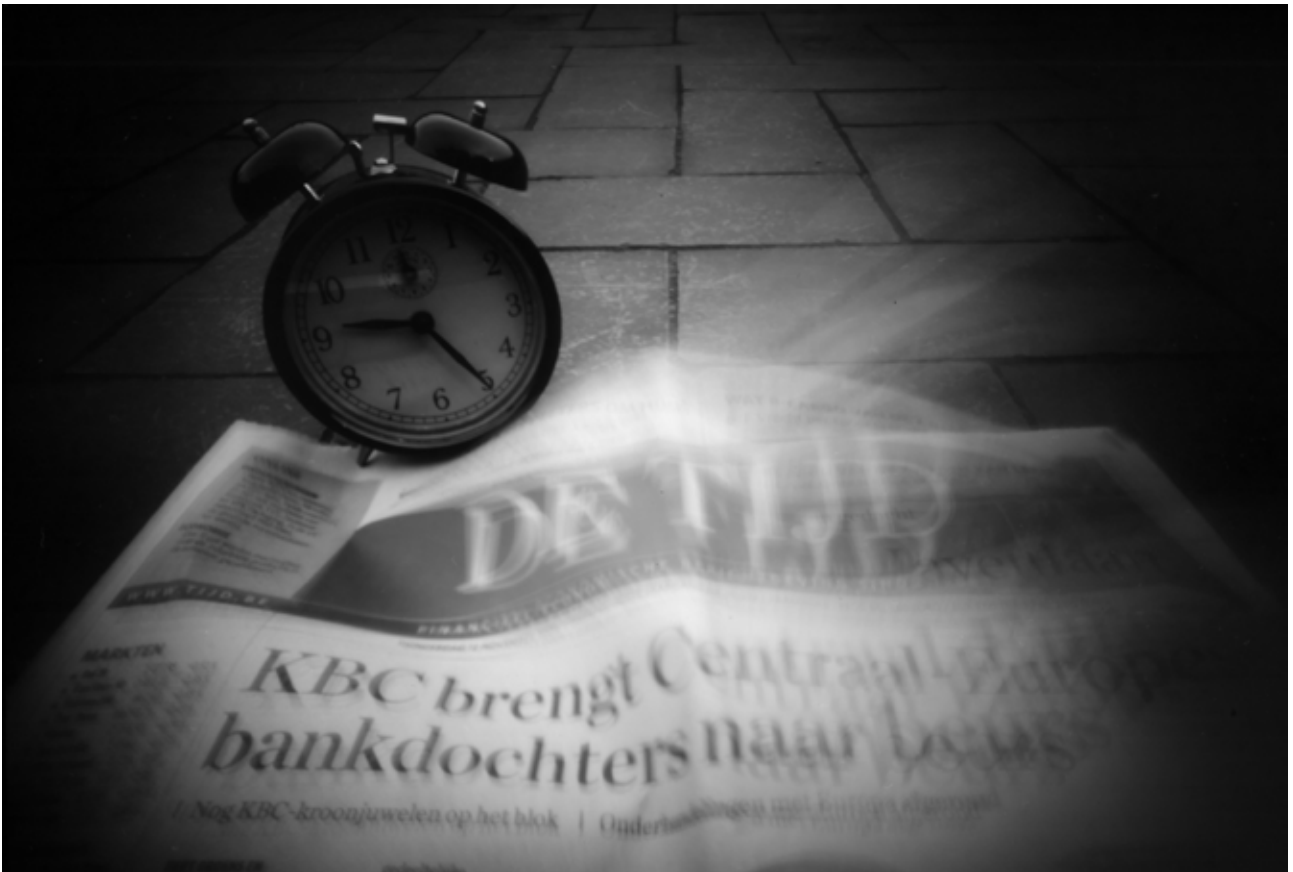
Time Elements. Barcelona, 2009 C Print Diasec,30x40 cm (4pcs)