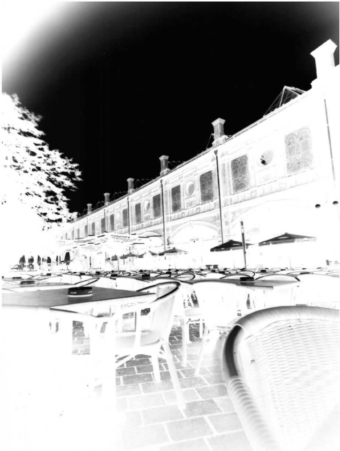
Hackescher Markt - Boxocam. Berlin, 2004 Silver Gelantine Print, 60x45 cm