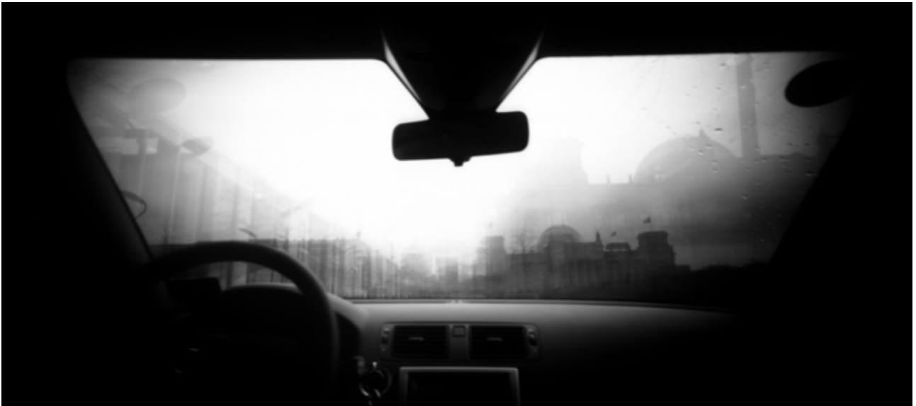
Grenzvernetzer – Platz der Republik. Berlin, 2008 C Print Diasec, 40x90 cm