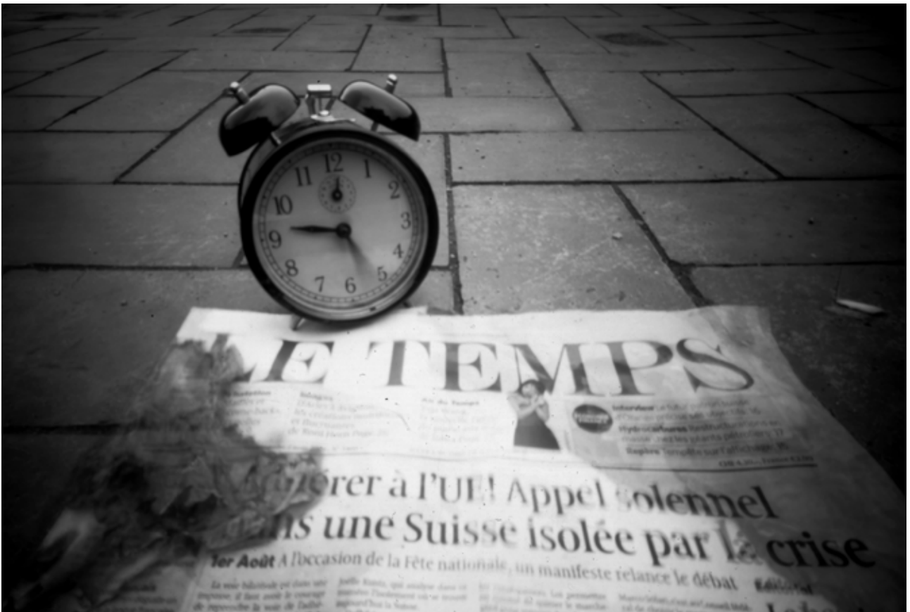
Time Elements. Barcelona, 2009 C Print Diasec,30x40 cm (4pcs)